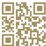
Up-to-the-minute Interest Rates

Superior Bank: Knowing that they had some of the best CD rates on the market, Superior Bank wanted to advertise their bank accounts but interest rates changed daily. So that customers could get the latest rates, they gave out the DP-369 Calculator Pouch with a QR Code that directed them to the rates for that day. The pouches were a huge hit and everyone loved the ease of scanning with their phones to get an updated rate.